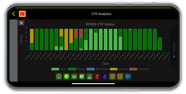
CTP Operating Status