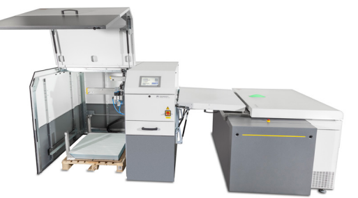
IMAGE UP TO 80 SONORA XTRA PLATES PER HOUR WITH THE KODAK MAGNUS Q800 PLATESETTER WITH T-SPEED

SONORA XTRA Plates are quick enough for the fastest platesetters, so you can get more out of your existing equipment, or you can upgrade your CTP to get to press even faster. With the T-speed KODAK MAGNUS Q800 Platesetter, you can image up to 80 SONORA XTRA Plates per hour.