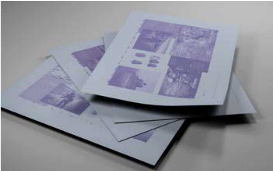
The TRENDSETTER Q400/Q800 Platesetter is fully compatible with SONORA Process Free Plates.

The new, optional, KODAK Mobile CTP Control App lets you monitor your TRENDSETTER Q400/Q800 Platesetter remotely with your Android or iOS device. Know instantly if one of your CTP devices needs attention, even if you are out of the room or off site, so you can get back to making plates quickly.