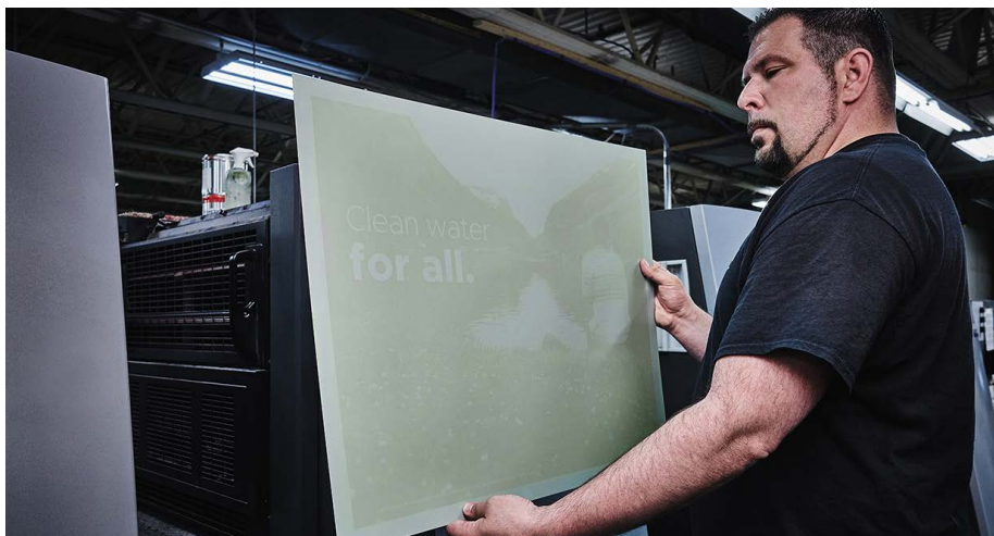
KODAK SONORA Process Free Plates

The optional KODAK Mobile CTP Control App lets you monitor your MAGNUS Q800 Platesetter remotely with your Android or iOS device. Know instantly if one of your CTP devices needs attention, even if you are away, so you can get back to making plates quickly. The latest version also provides customizable reports on CTP uptime, plate usage, shift performance, and more, so you can make informed decisions to increase productivity and efficiency.