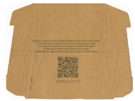
with high-density, high-speed inkjet options from Kodak

... to streamlined "perfecting at the folder"