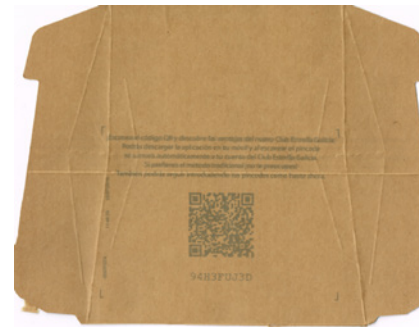
Replace low-density, low-speed options