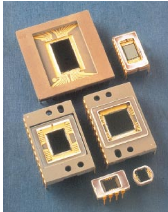
FIGURE 1. Historically, the optical format value for a CCD derives from the days when Vidicon vacuum tubes were used as sensing elements in television cameras. A 1-in. vidicon tube approximately 1 in. in diameter has a photosensitive area with a diagonal of 16 mm (about 2/3 in.). A CCD with a 16-mm diagonal is thus called a 1-in. CCD. Eastman Kodak makes interline CCD sensors in a variety of sizes.